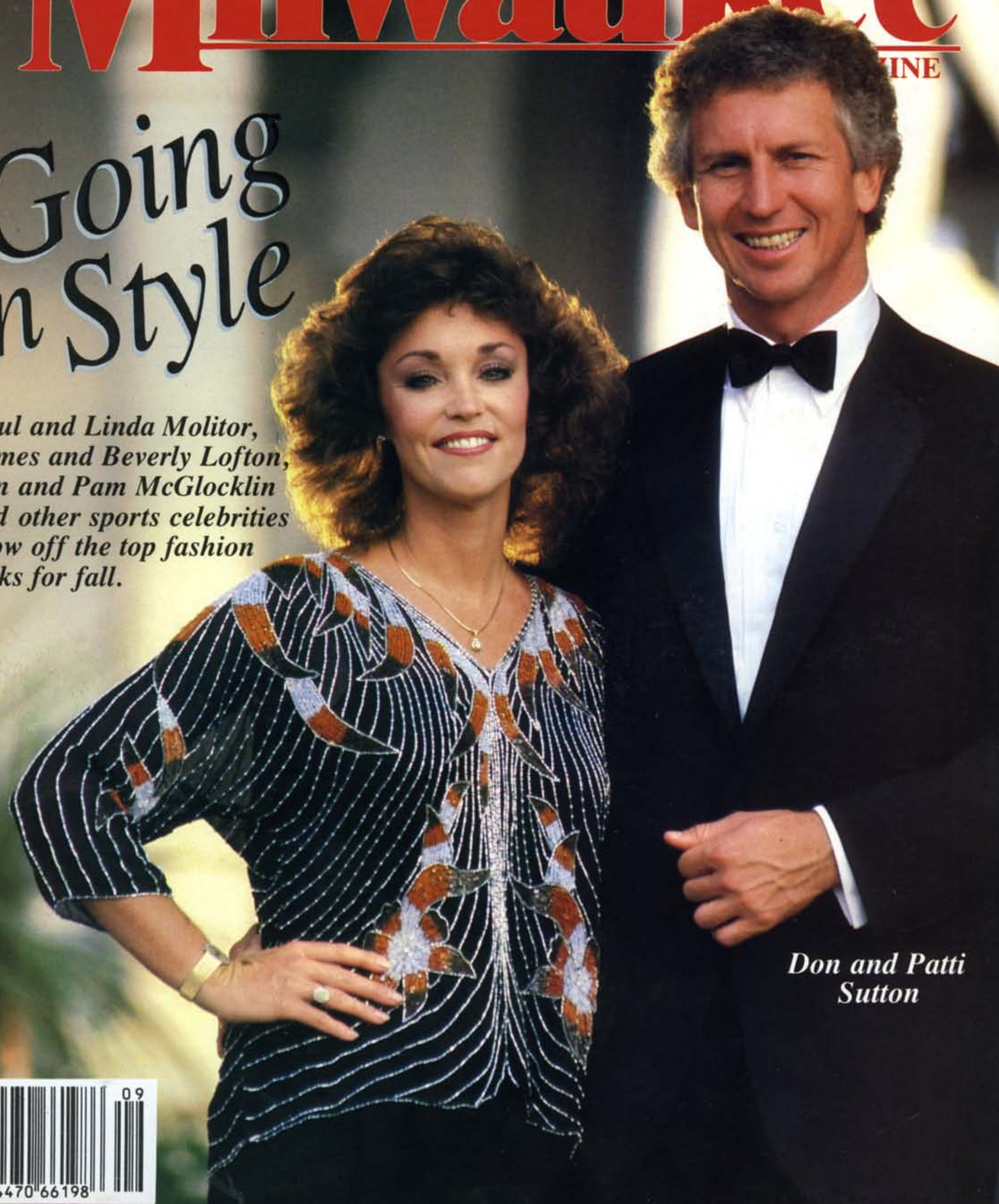
Don and Patti Sutton